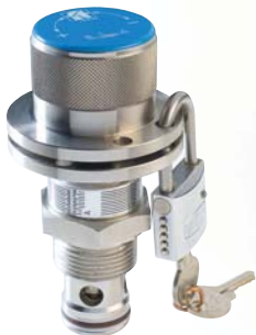
FT LC Handwheel with padlock