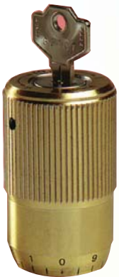
FT CH Handwheel with key