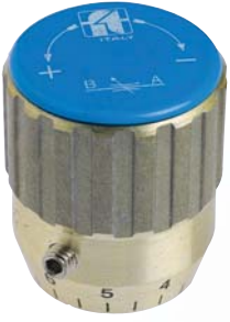
FT MA Aluminium handwheel for valves series FT 257 and FT 1250