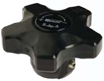
FT MP ABS handwheel for valves series FT 257 and FT 1250