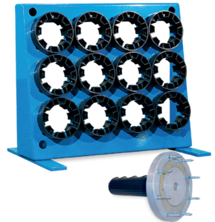
Tool base and Tool rack with QuickChange-tool as an option.