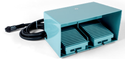
Foot pedal as an option.