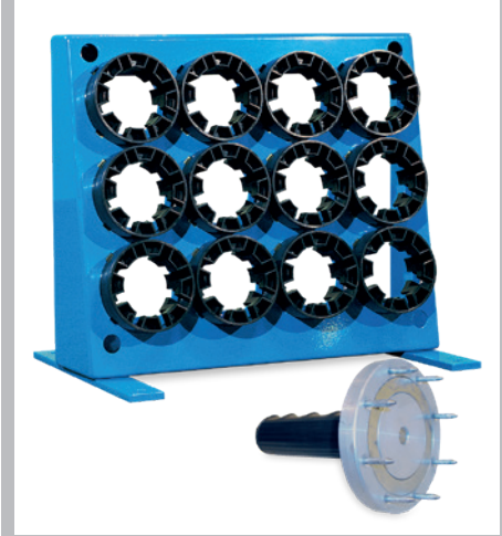
Tool base and Tool rack with QuickChange-tool as an option.